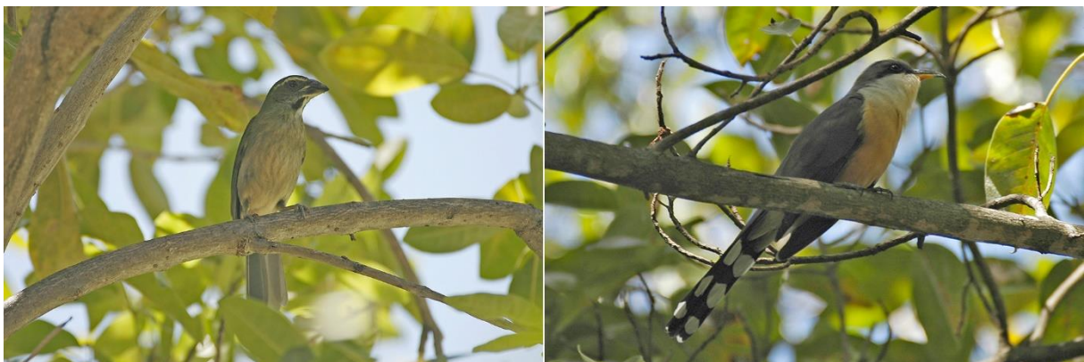
Left: Lesser Antillean Saltator, 18 March 2006, Deshaies, Guadeloupe; right: Mangrove Cuckoo, 25 March 2006, Sainte-Marie, Martinique