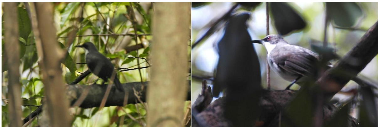
White-breasted Thrasher, 26 March 2006, Presqu'île de Caravelle, Martinique; © Jan van der Laan.