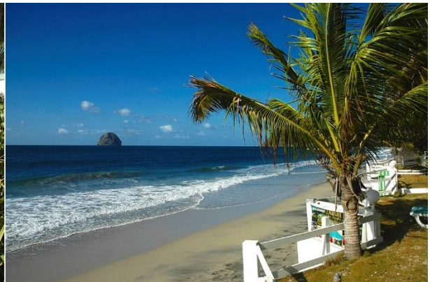
Left: our house at Le Diamant; right: rock with nesting Tropicbirds at Le Diamant, Martinique, 29 March 2006