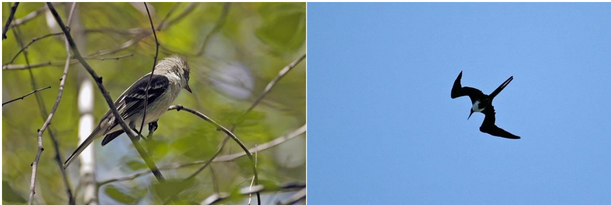
Left: Caribbean Elaenia; right: female Magnificent Frigatebird; both on 18 March 2006, Deshaies, Guadeloupe