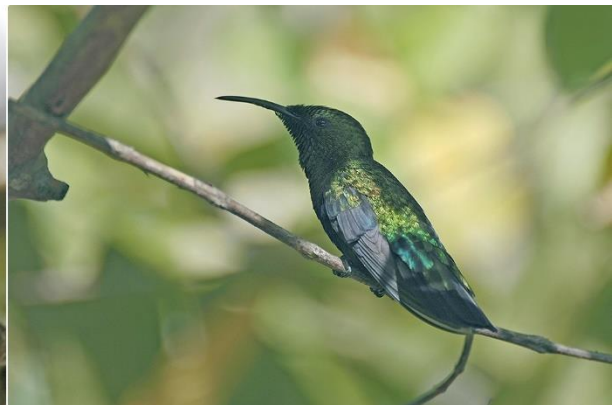
Left: Antillean Crested Hummingbird, 22 March 2006, Deshaies, Guadeloupe; right: Green-throated Carib, 30 March 2006, Le Diamant, Martinique