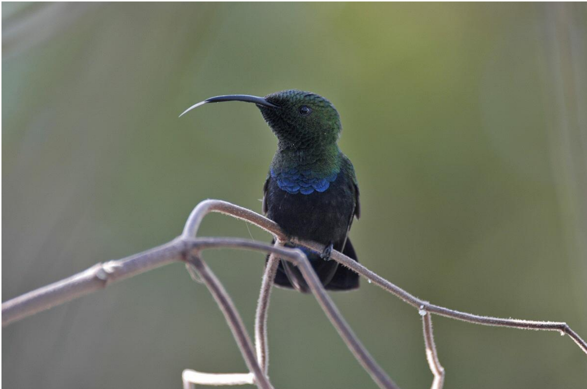
Green-throated Carib - Eulampis holosericeus - Le Diamant, Martinique