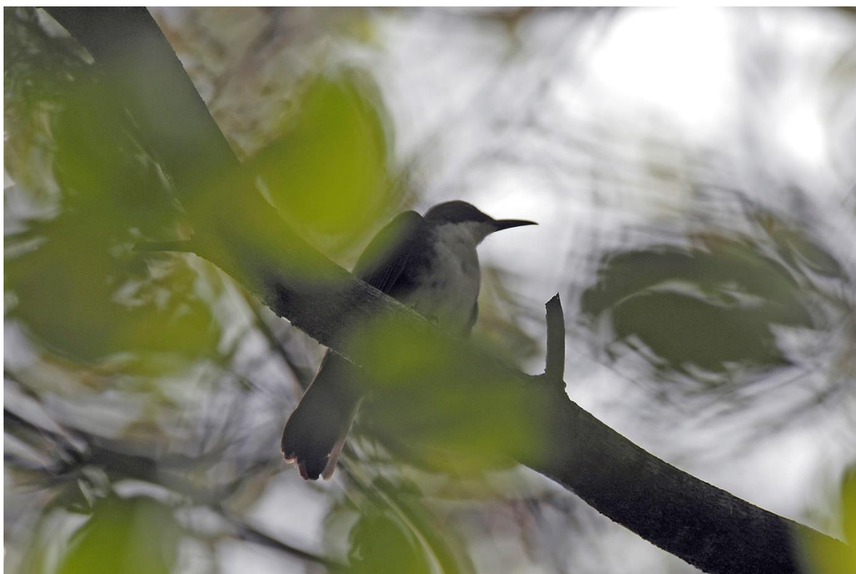
White-breasted Thrasher, 26 March 2006, Presqu'île de Caravelle, Martinique; © Jan van der Laan.