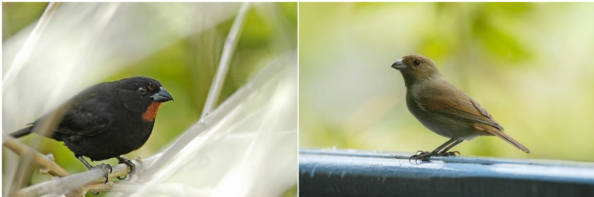
Lesser Antillean Bullfinches. Left: male on 30 March 2006 at Le Diamant, Martinique; right: female on 17 March 2006, Deshaies, Guadeloupe