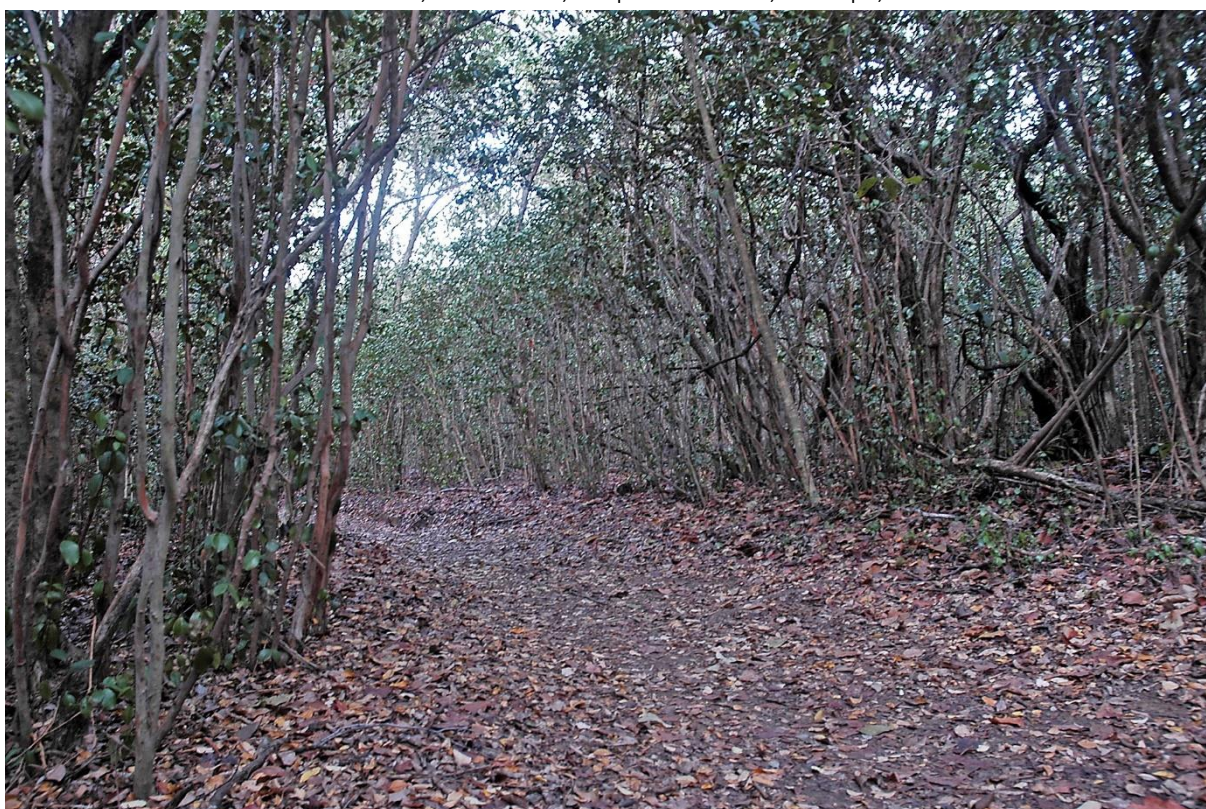
More habitat of White-breasted Thrasher, 26 March 2006, Presqu'île de Caravelle, Martinique; © Jan van der Laan 2006.