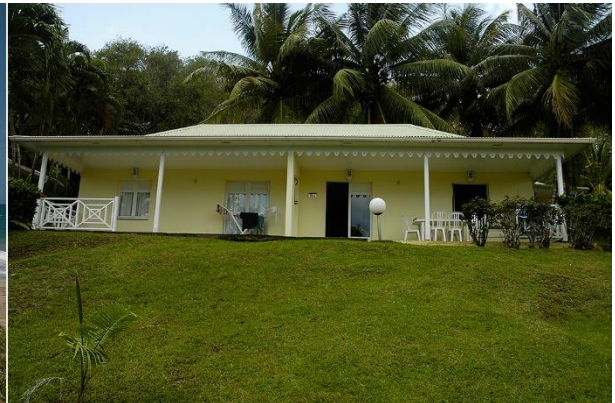
Left: northern part of Guadeloupe, 23 March 2006; right: our house between 23 and 27 March 2006, Sainte-Marie, Martinique