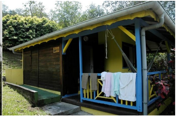
Left: view from Deshaies, right: our house at Deshaies, Guadeloupe, 18 March 2006