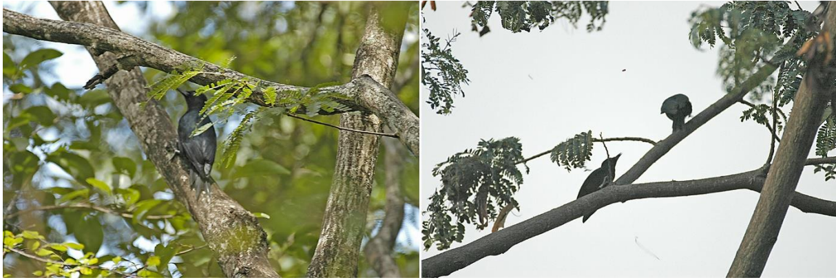
Guadeloupe Woodpeckers, 17 and 21 March 2006, Deshaies, Guadeloupe