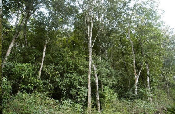
Left: harbour of Deshaies; right: habitat of Forest Thrush at Deshaies, Guadeloupe, 21 March 2006; © Jan van der Laan 2006.