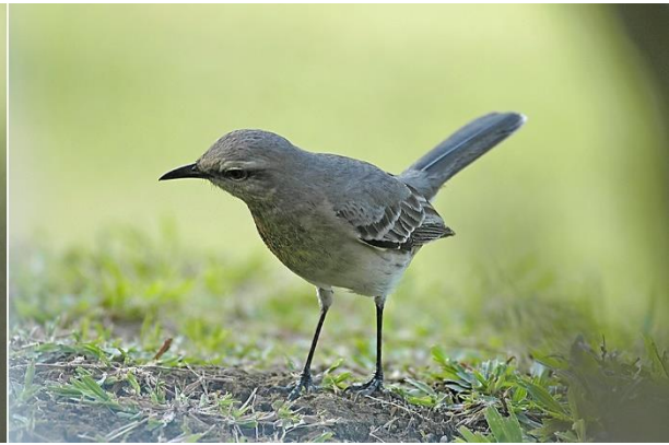
Tropical Mockingbird, 24 March 2006, Sainte-Marie, Martinique