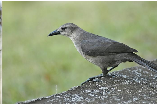
Carib Grackles; left: male displaying, 18 March 2006, Deshaies, Guadeloupe; right: female, 24 March 2006, Sainte-Marie, Martinique