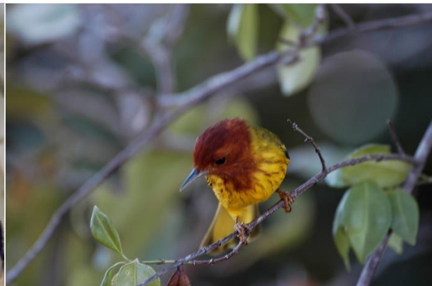
Left: American Yellow Warbler, 18 March 2006, Deshaies, Guadeloupe; right: Mangrove Warbler, 24 March 2006, Sainte-Marie, Martinique