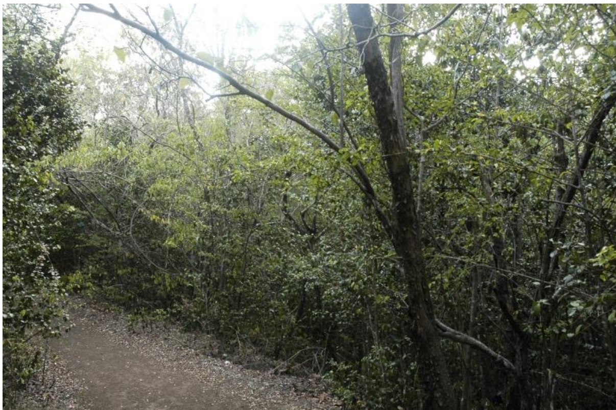
Habitat of White-breasted Thrasher, 26 March 2006, Presqu'île de Caravelle, Martinique; © Jan van der Laan 2006.