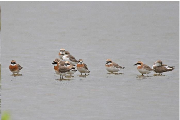
Left: Curlew Sandpipers; right: Lesser & Greater Sandplovers; 27 April 2019, Deep Bay Mudflats, Mai Po, Hong Kong