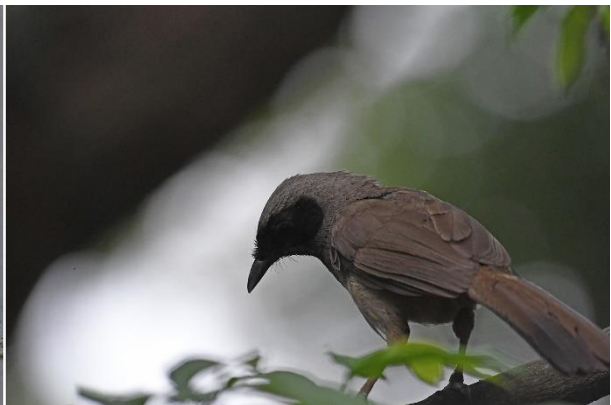
Left: Black-faced Spoonbills; right: Masked Laughingthrush; both on 27 April 2019, Mai Po