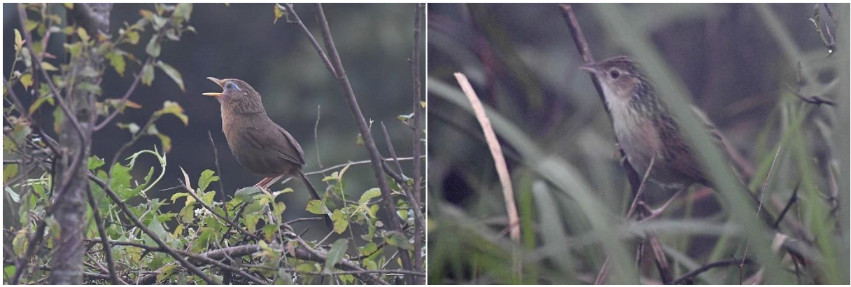
Left: Chinese Hwamei; right: Chinese Grassbird; both on 27 April 2019, Tai Mo Shan, Hong Kong