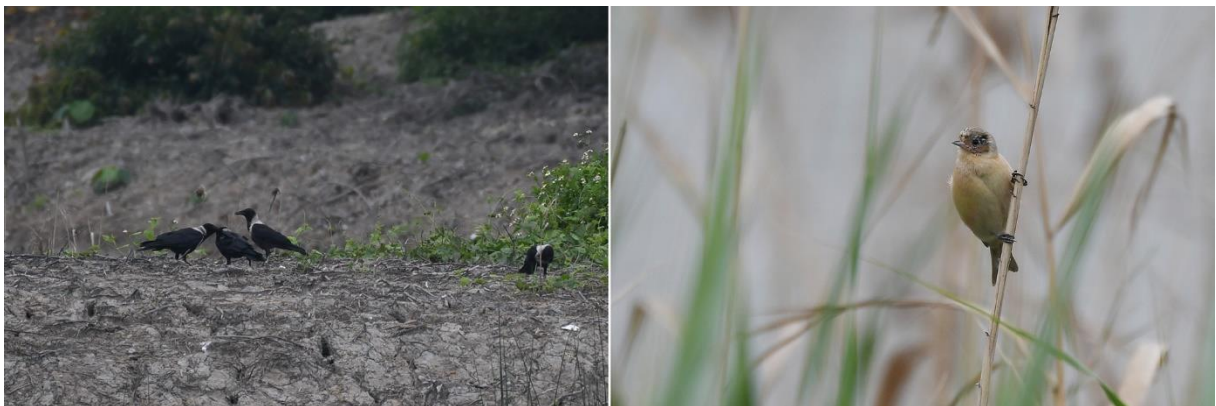
Left: Collared Crow; right: Chinese Penduline Tit; both on 27 April 2019, Mai Po, Hong Kong