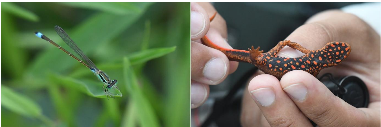
Left: Common Bluetail, Mai Po, Hong Kong; right: Honk Kong Newt, Tai Mo Shan, both on 27 April 2019