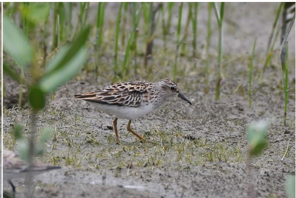
Left: Red-necked Stints; right: Long-toed Stint; all on 27 April 2019, Deep Bay Mudflats, Mai Po, Hong Kong; © Jan van der Laan.