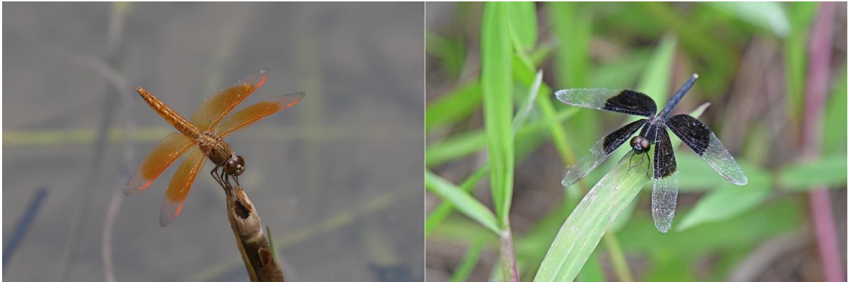
Left: Asian Amberwing; right: Pied Percher; both on 27 April 2019, Mai Po, Hong Kong