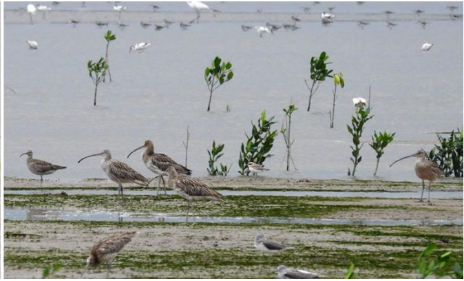
Left: Three Asian Dowitchers; 27 April 2019, Mai Po, Hong Kong; right: Whimbrel (leftmost bird), four Eurasians Curlew and far right, a Far Eastern Curlew, also 27 April 2019, Mai Po, Hong Kong