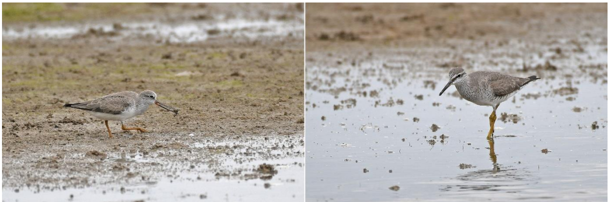
Left: Terek Sandpiper; right: Grey-tailed Tattler; both on 27 April 2019, Deep Bay Mudflats, Mai Po, Hong Kong