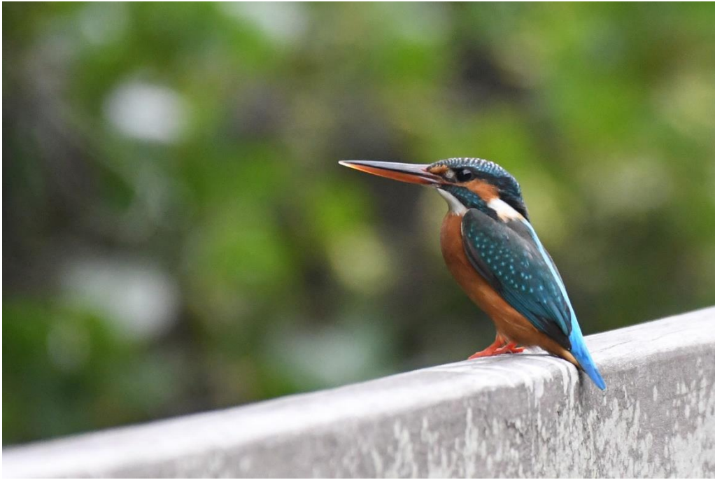
Common Kingfisher, 27 April, Mai Po