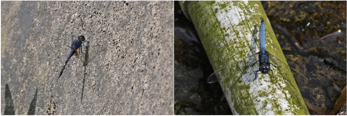
Left: Indigo Dropwing; right: Common Blue Skimmer; both on 27 April 2019, lower elevations Tai Mo Shan, Hong Kong; © Jan van der Laan.