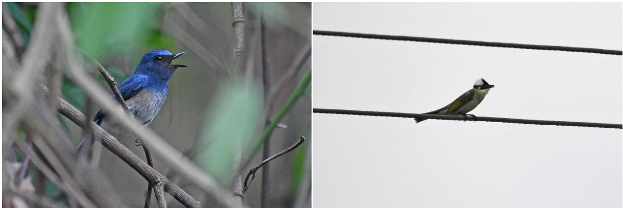
Left: Hainan Blue Flycatcher, 27 April 2019, Tai Mo Shan; right: Light-vented Bulbul, 27 April 2019, Mai Po, Hong Kong