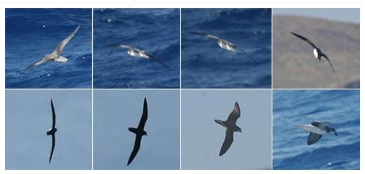
Flight action of Desertas Petrel on 10 July 2008 between the Desertas and Madeira. The bird flies low over the sea surface, then it catches wind and towers into the air with an high arc far above the horizon. Then the bird turns 180 degrees and the whole process starts again. © Jan van der Laan.