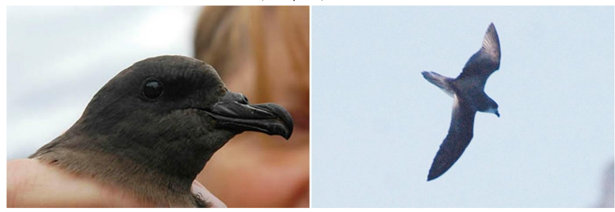
Left: Bulwer's Petrel at Deserta Grande, Ilhas Desertas; right: Desertas Petrel near Ilhas Desertas, 10 July 2008; © Jan van der Laan.