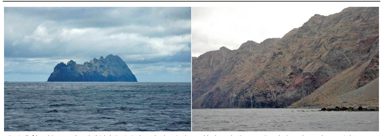
Bugio (left) and Deserta Grande (right). Bugio is the only place in the world where the Desertas Petrel - Pterodroma desertae is known to breed, 10 July 2008