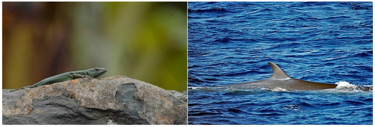
Left: Madeiran Lizard, Funchal, 8 July 2008; right: whale between Madeira and the Desertas, 10 July 2008