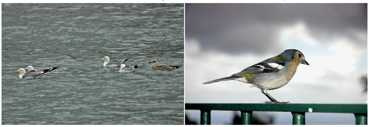
Left: Atlantic Yellow-legged Gull in the harbour of Funchal, 9 July 2008; right: Madeiran Chaffinch, Monte Palace, Funchal on 12 July 2008; Note the characteristic colours of the upperparts and pink orange cheeks; © Jan van der Laan.