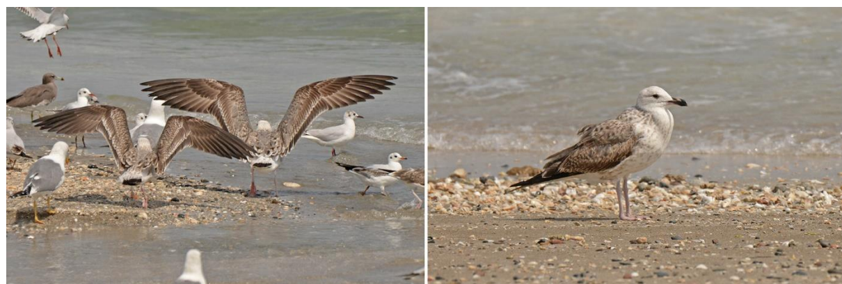
First-year Steppe Gulls at Kalba Corniche, Fujairah