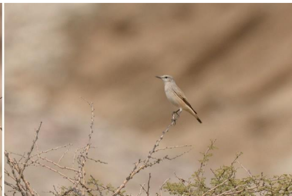
Left and right: Persian Wheatear at Masafi Wadi, north of Fujairah