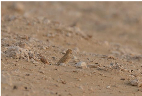
Black-crowned Finch Larks; left: male right: female, both at the Al Qudra Pivots, Saih al Salam, Dubai; © Jan van der Laan.