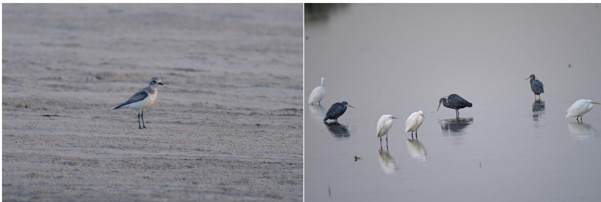
Left: 2 nd calendar year Tibetan (Lesser) Sand Plover; right: Western Reef Herons, both at Khor al-Beida