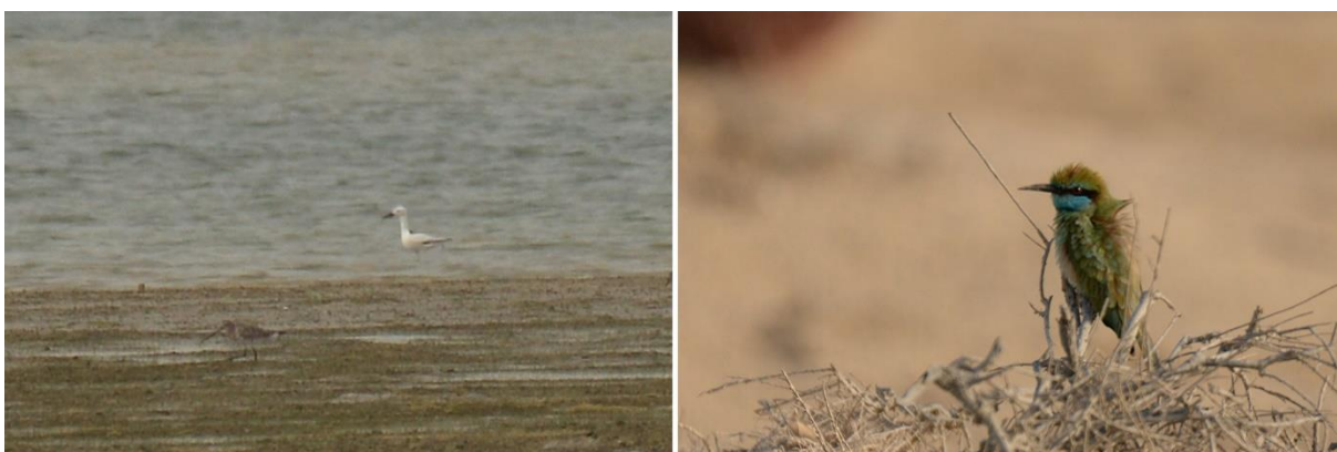
Left: one of the four Crab Plovers; right: Arabian Green Bee-eater, both at Khor al-Beida, Umm al-Qaiwain; © Jan van der Laan.