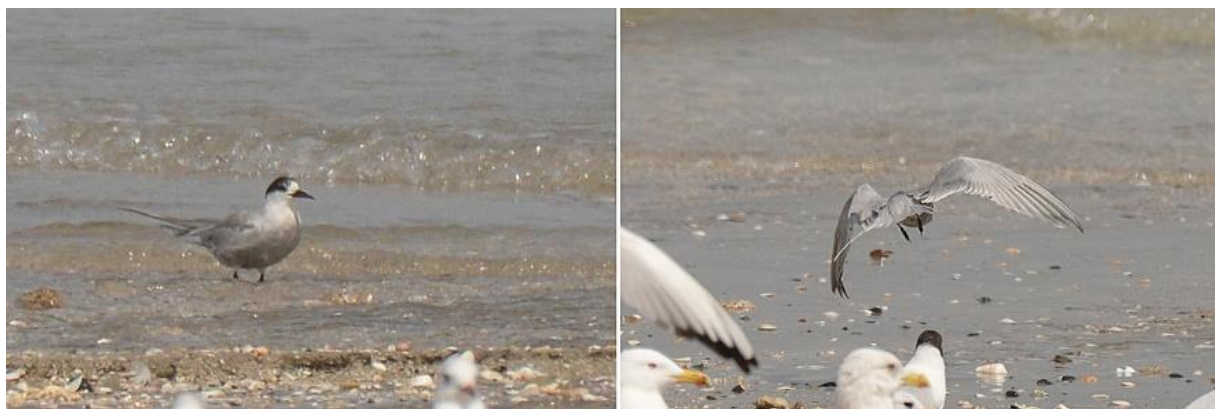
White-cheeked Tern at Kalba Corniche, Fujairah; note the grey rump and upper tail; © Jan van der Laan.