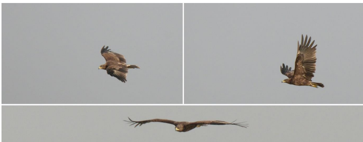
Spotted Eagle at Khor al-Beida