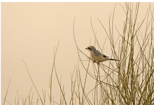
Steppe Grey Shrikes at the Al Qudra Pivots, Saih al Salam, Dubai