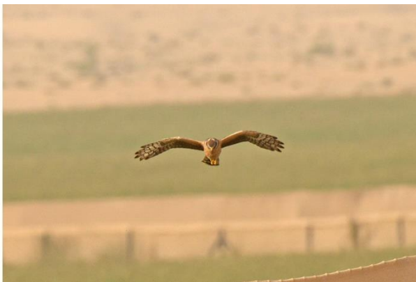
Pallid Harriers at the Al Qudra Pivots, Saih al Salam, Dubai