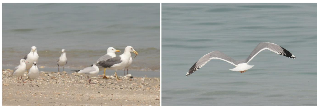
Left: Heuglin's Gull (far right with darker mantle); right: Steppe Gull (with diagnostic primary pattern), both at Kalba Corniche, Fujairah