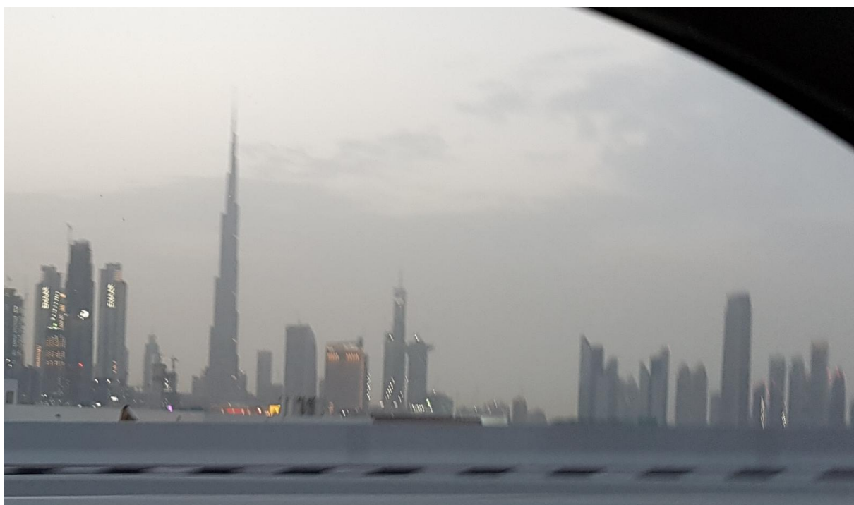
Skyline of Dubai city; © Arjan Brenkman.