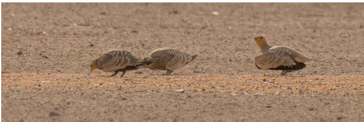
Chestnut-bellied Sandgrouses at Saih al Salam (general area) with two females on the left and right a male; © Jan van der Laan.