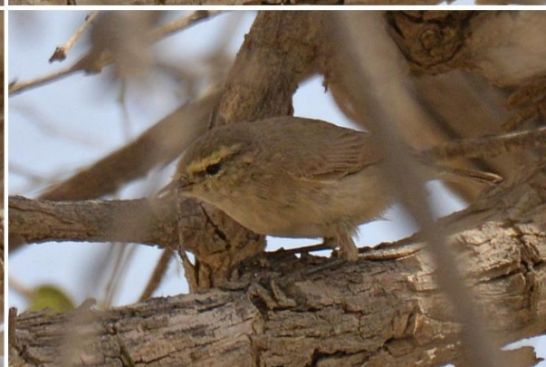
Plain Leaf Warbler at Masafi Wadi, north of Fujairah; note the broad supercilium!