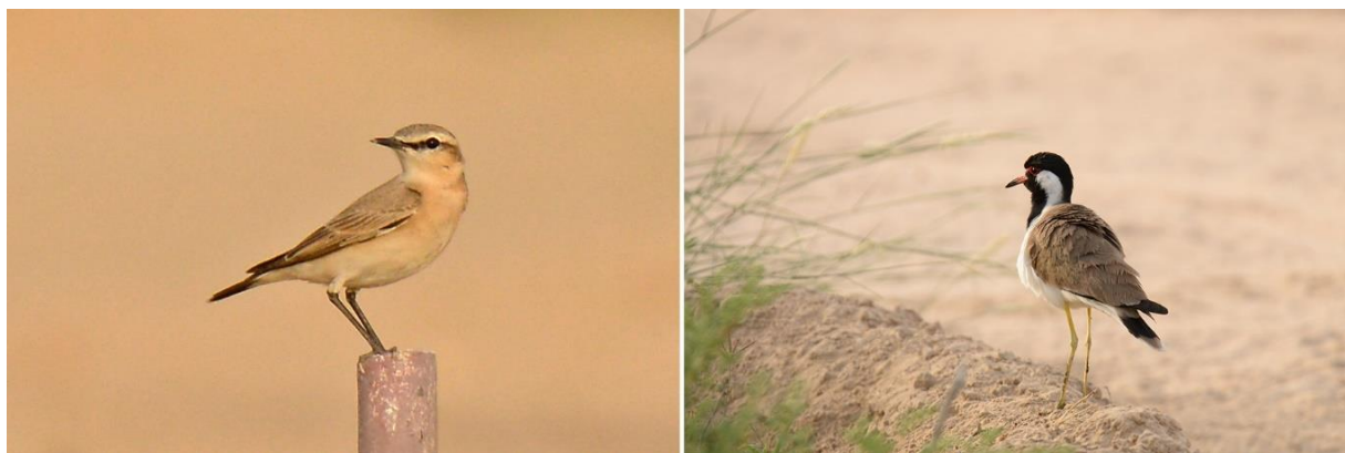
Left: Isabelline Wheatear; right: Red-wattled Plover, both at the Al Qudra Pivots, Saih al Salam, Dubai; © Jan van der Laan.