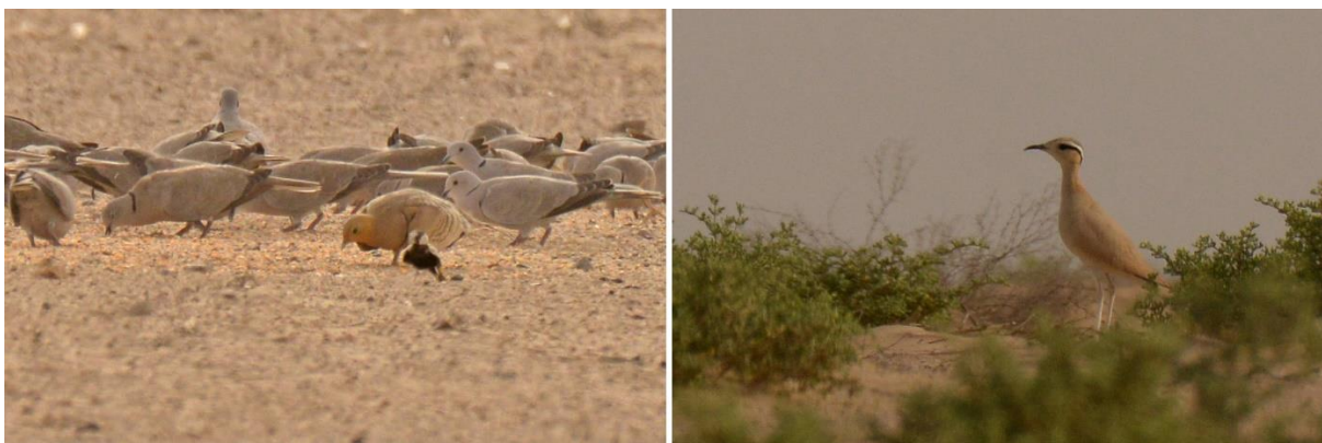
Left: Black-crowned Finch Lark; right: Cream coloured Courser at Saih al Salam (general area); © Jan van der Laan.