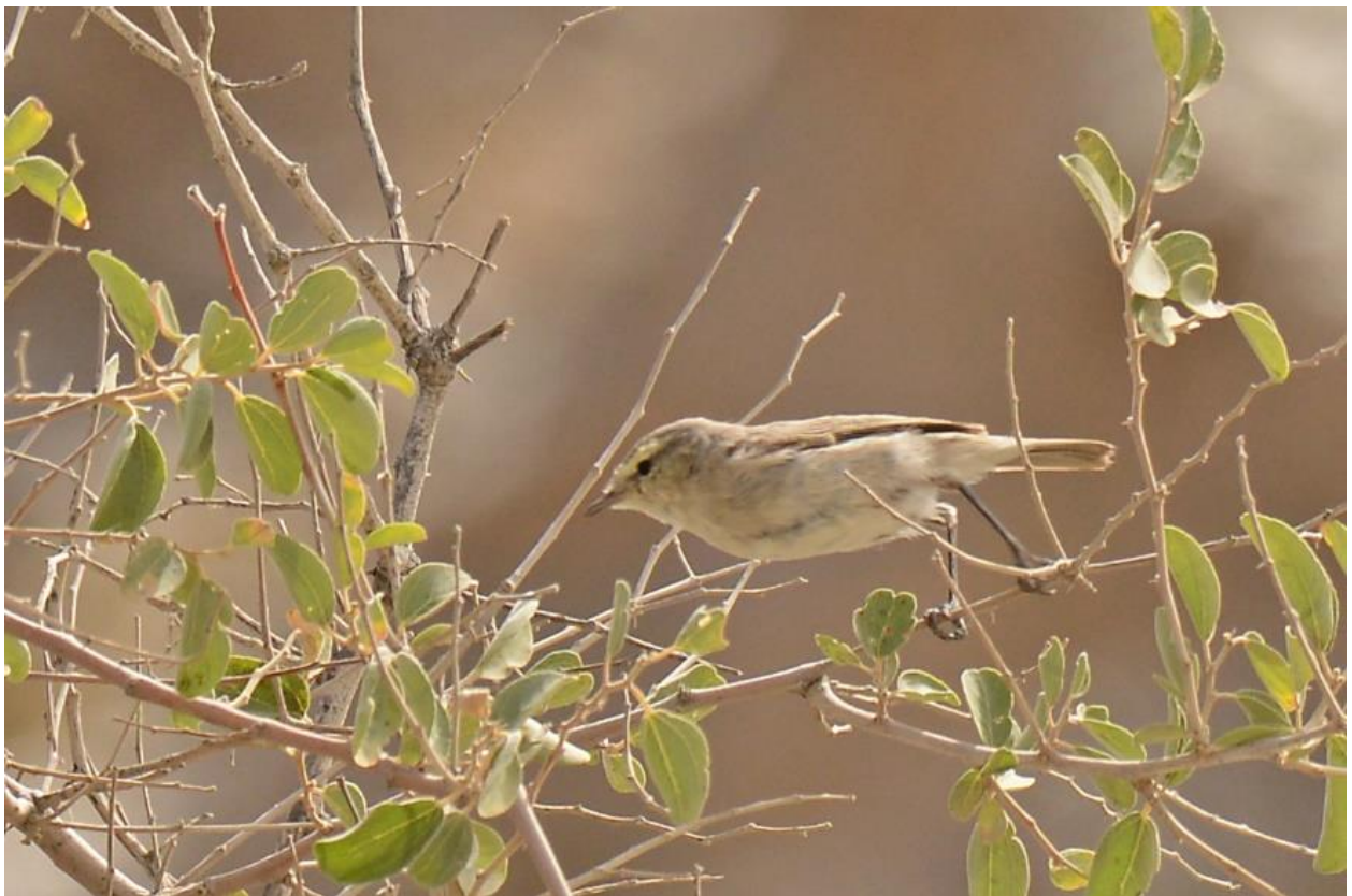
Plain Leaf Warbler, 24 February 2018, Masafi Wadi, Fujairah UAE