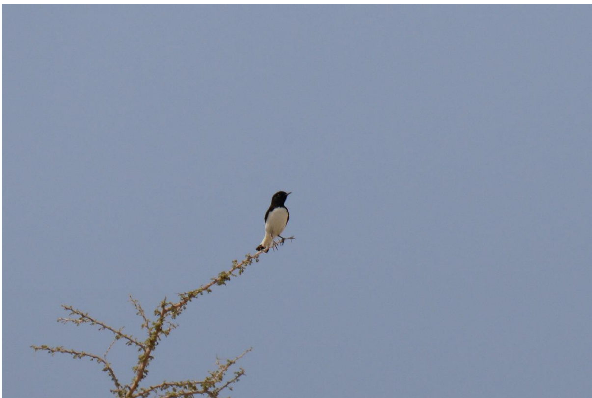
Left: Humes Wheatear at Masafi Wadi, north of Fujairah