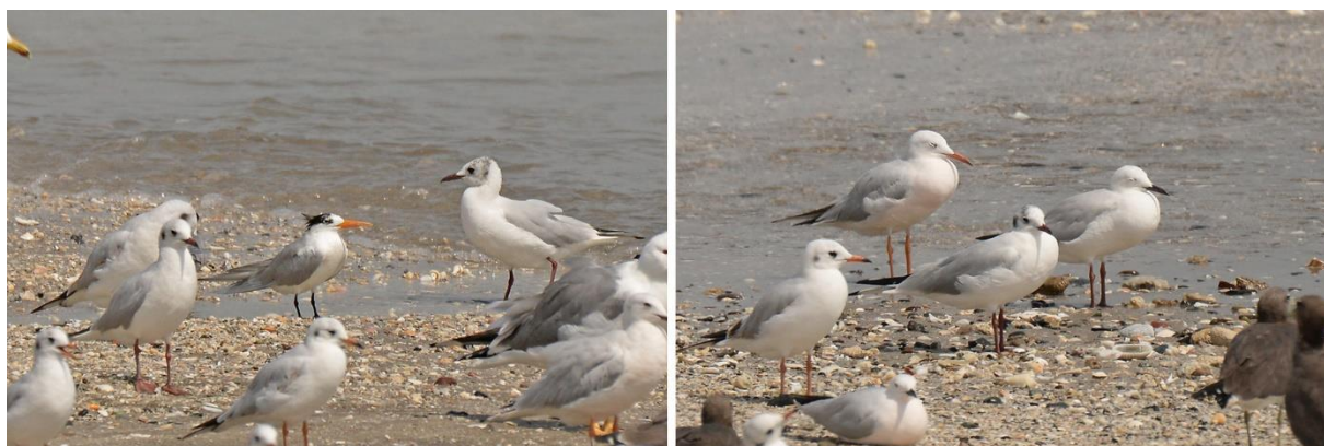
Left: Lesser Crested Tern; right: Slender-billed Gulls, both at Kalba Corniche, Fujairah; © Jan van der Laan.