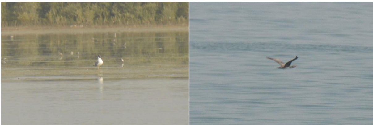
Left: Pallas's Gull, Khor al-Beida, Umm al-Qaiwain; left: Socotra Cormorant passing by at Kalba Corniche, Fujairah