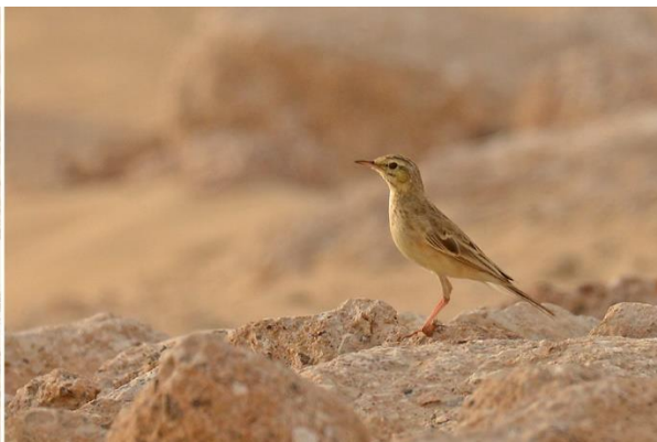
Left: Water Pipit, probably race coutellii ; right: Tawny Pipit, both at the Al Qudra Pivots, Saih al Salam, Dubai; © Jan van der Laan.