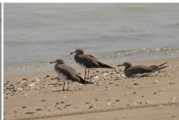
Sooty Gulls at Masafi Wadi, Kalba Corniche, Fujairah