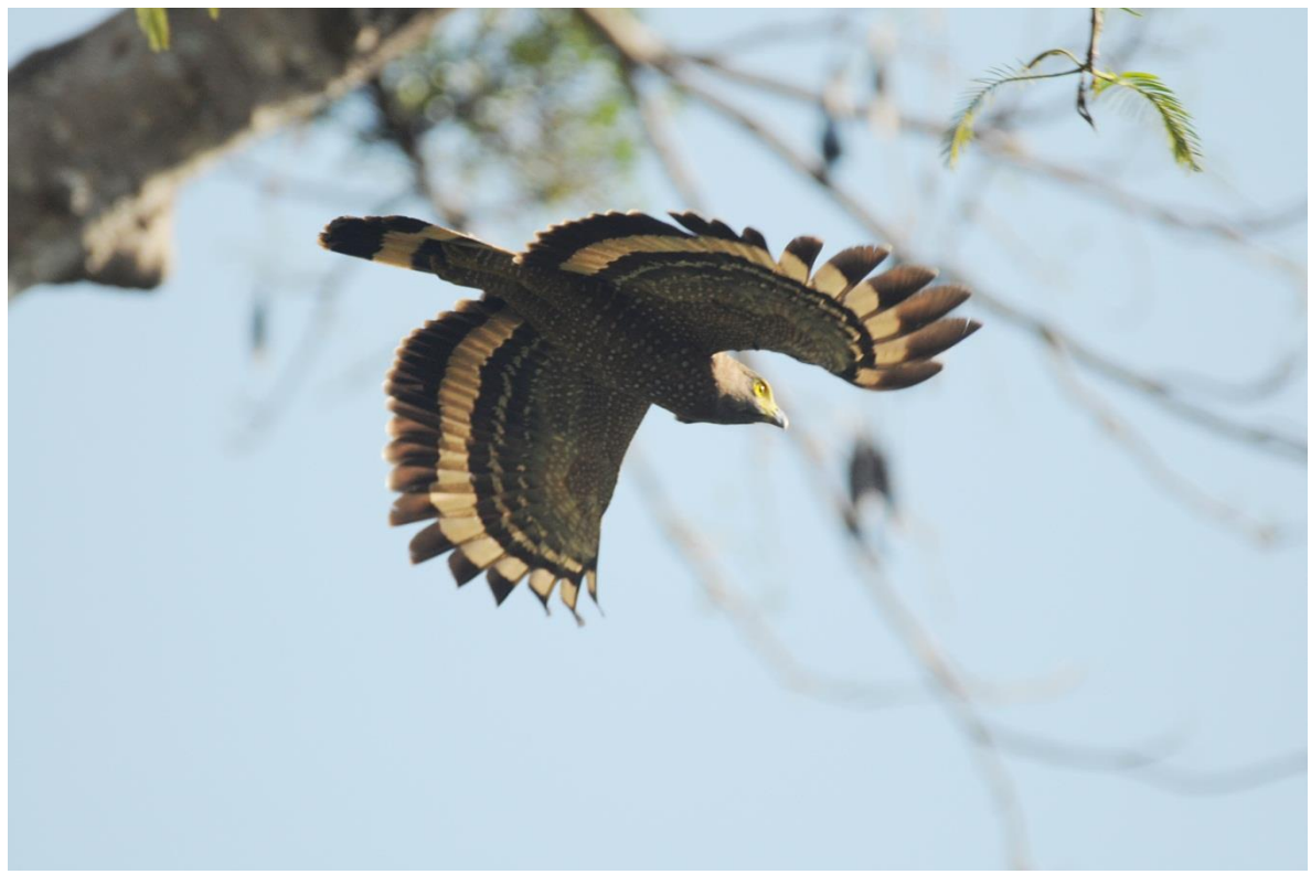
Philippine Serpent-Eagle at Subic Bay on 7 April 2013; © Jan van der Laan.