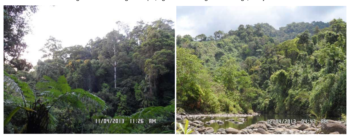
Left: view from camp 2: beautiful primary forest; right: river crossing at Sawa Village; © Arjan Brenkman.