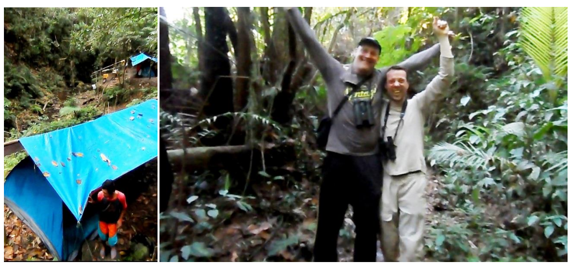
Left: camp 2, with our tents in front and the kitchen in the back; right: victory! the Whiskered Pitta is in the bag!