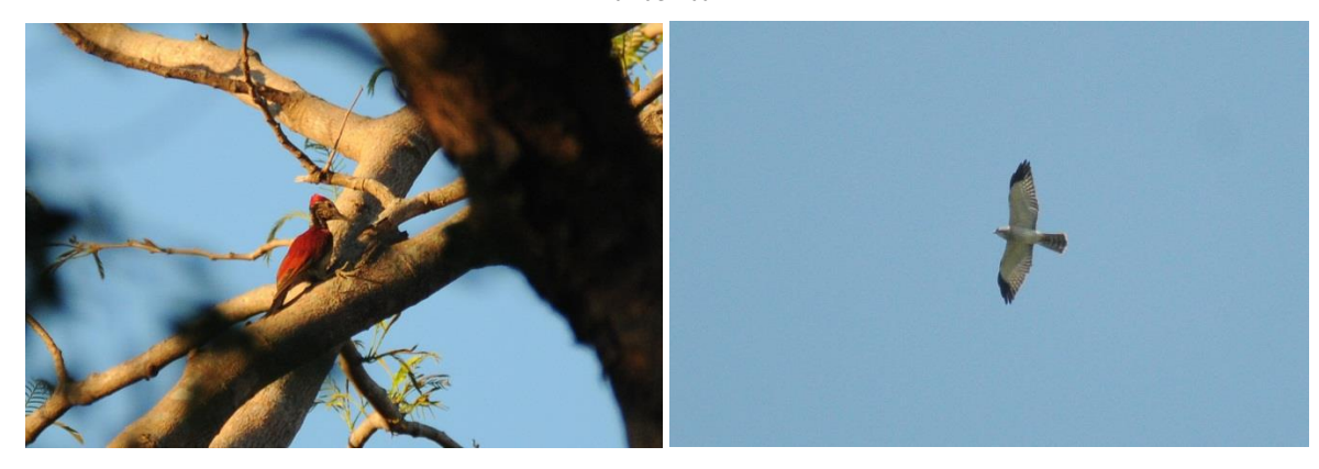
Left: Luzon Flameback at Subic Bay on 7 April 2013; right: migrating Chinese Sparrow-Hawk at Subic Bay on 7 April 2013; © Jan van der Laan.