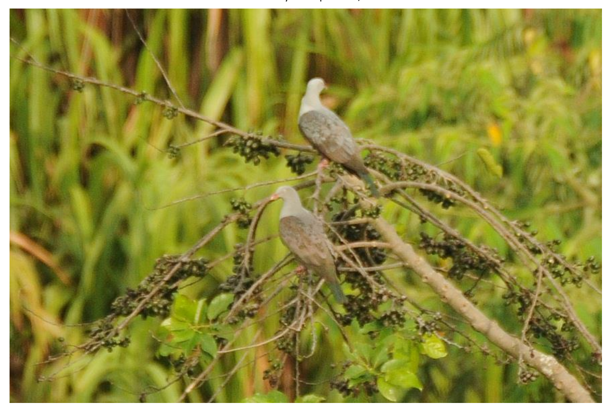
Spotted Imperial Pigeon on our way to camp 2 on 9 April 2013; this part of Luzon is probably the best location in the Philippine to see this enigmatic and declining pigeon; © Jan van der Laan.