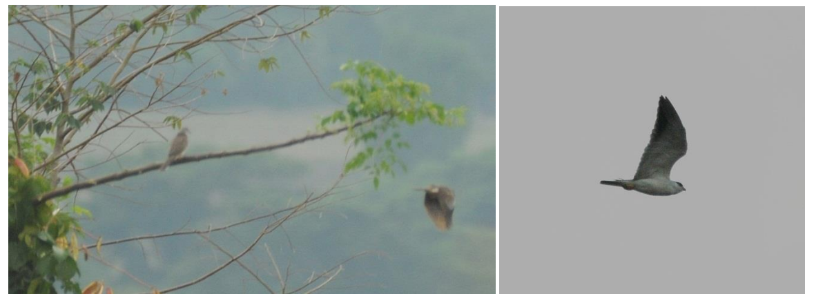
Left: Philippine Collared Dove (left bird, the bird on the right is a Spotted Dove); right: Black-winged Kite, both during the walk to camp 1 on 9 April 2013; © Jan van der Laan.