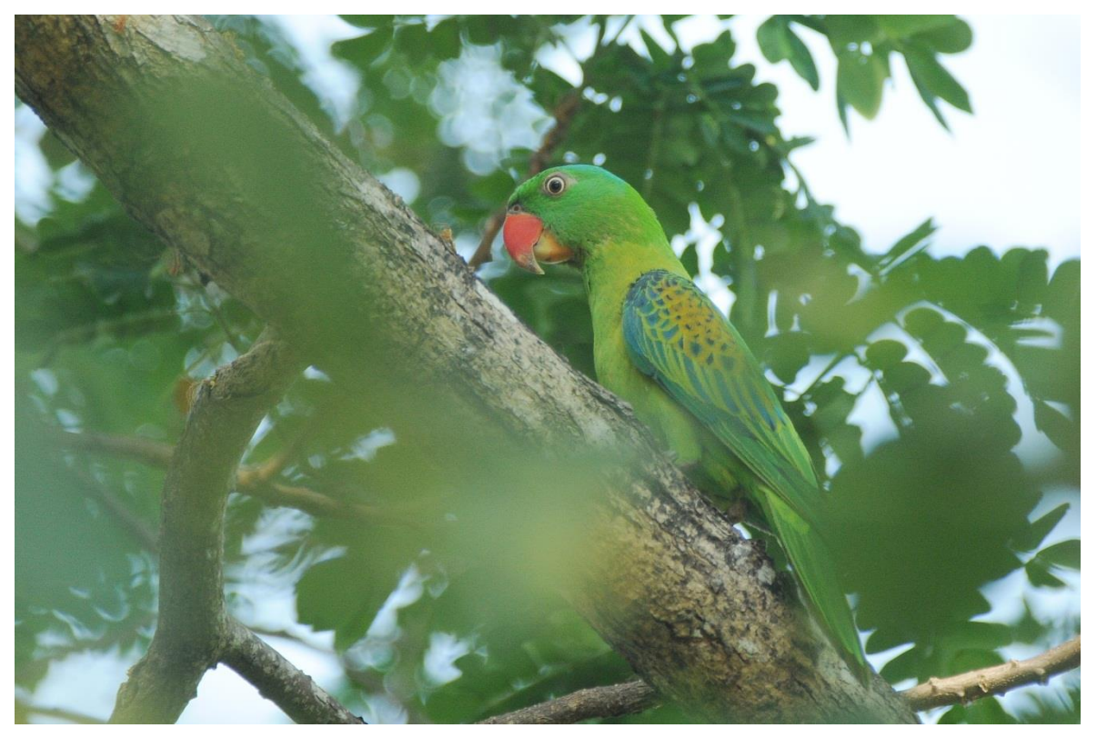
Blue-naped Parrot at Subic Bay on 7 April 2013; still a healthy population in Subic bay; © Jan van der Laan.