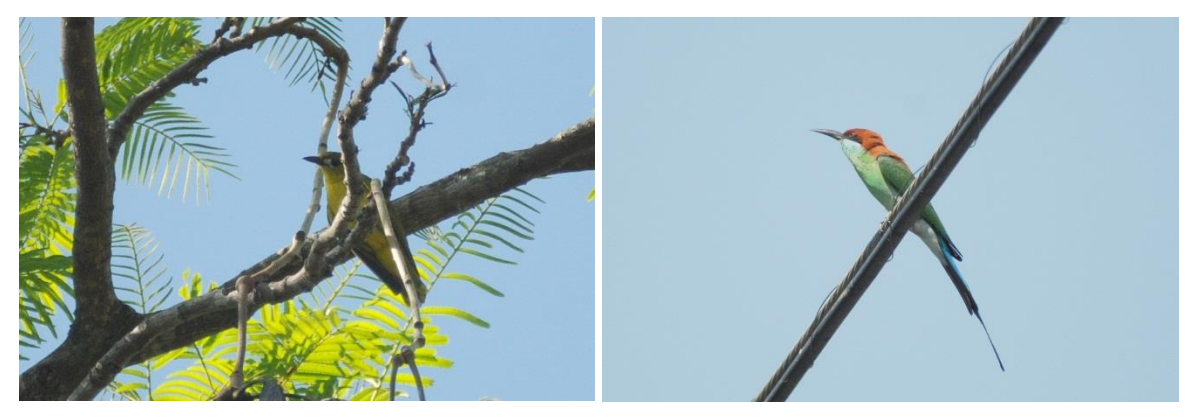
Left: White-lored Oriole at Subic Bay on 7 April 2013; right: Rufous-crowned or 'American' Bee-eater at Subic Bay on 7 April 2013; © Jan van der Laan.