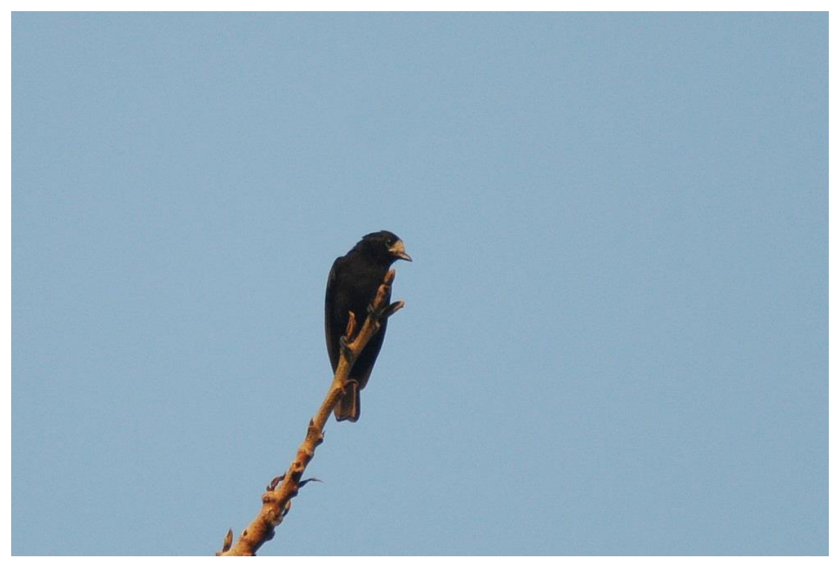
White-fronted Tit at Subic Bay on 7 April 2013; © Jan van der Laan.