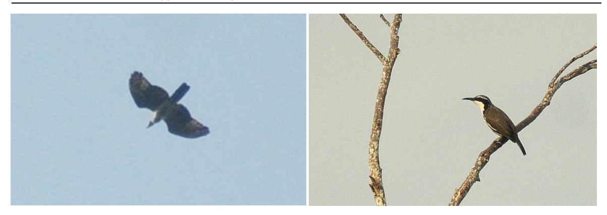
Left: Oriental Honey-Buzzard (not a Philippine Hawk-Eagle), Sawa village on 12 April; right: Stripe-headed Rhabdornis just below Sawa Village on 9 April; © Jan van der Laan.