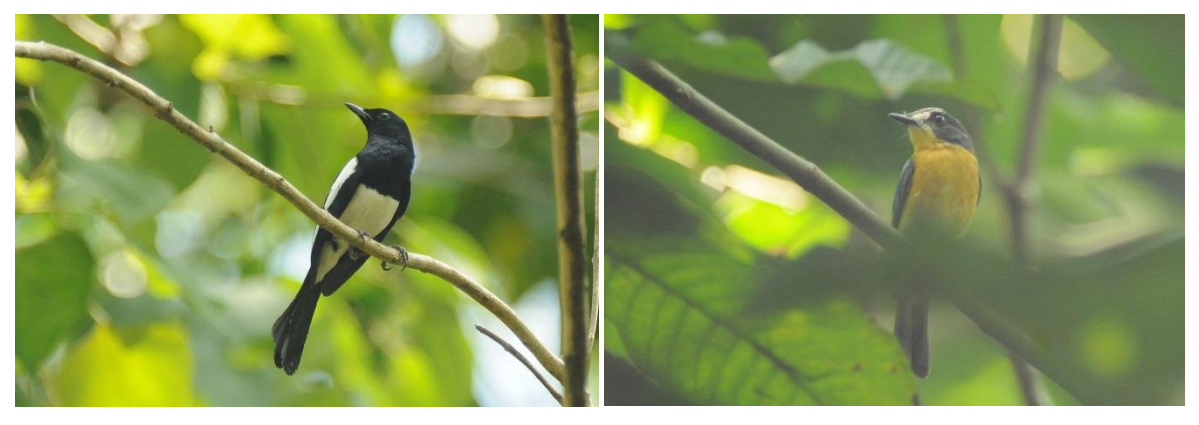
Left: Philippine Magpie-Robin in La Mesa Ecopark. Right: Mangrove Blue Flycatcher, a possible future split, also seen in La Mesa Ecopark