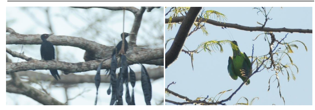
Left: Sooty Woodpeckers at Subic Bay on 7 April 2013; right: Green Racket-tail at Subic Bay on 7 April 2013, showing its rackets; © Jan van der Laan.