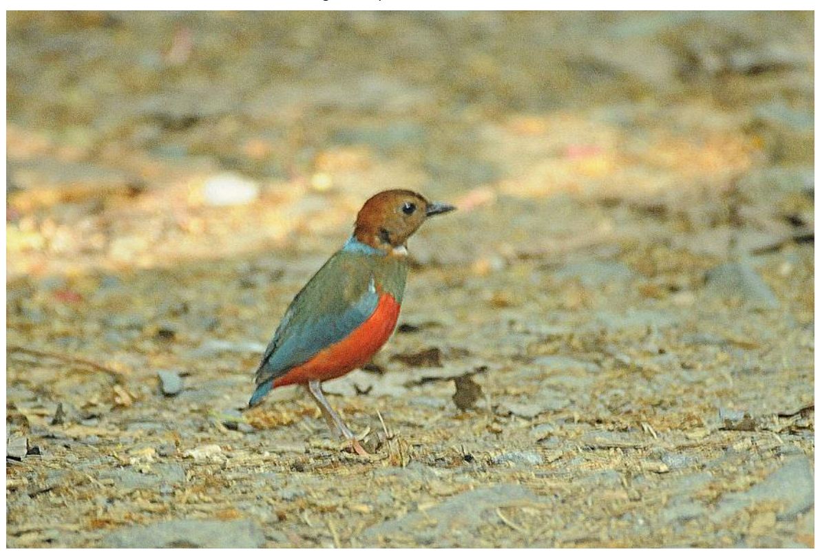
Philippine or Red-bellied Pitta in La Mesa Ecopark. Irestedt et al 2013 split the Red-bellied Pitta complex into 17 species. Gill, F & D Donsker (Eds). 2016. IOC World Bird List (v6.3) split the complex into 10 species; as the Pitta from Talaud, Indonesia is regarded as a subspecies of Philippine Pitta, this is not a Philippine endemic; © Jan van der Laan.