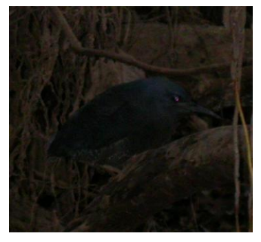
Zigzag Heron Zebrilus undulatus

Order, nomenclature and taxonomy follow The Birds of Ecuador: Status, Distribution and Taxonomy (see recommended reading).